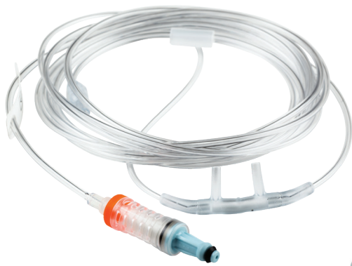
NomoLine LH Adult Nasal Cannula

No-moisture sampling lines for intubated and non-intubated patients in low- and high-humidity applications