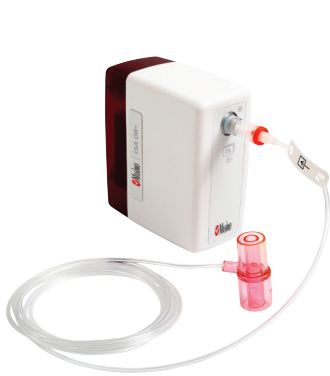
The NomoLine Airway Adapter Set connects to the ISA module

Root capabilities expand with the ISA™ family of modules to include real-time capnography and gas measurements