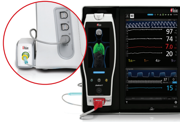
The ISA module easily mounts to the back of the Root monitor and connects via the Masimo Open Connect® (MOC-9®) ports