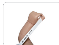
Inf thumb application