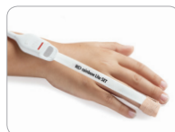
Inf finger application