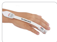
Pdt finger application