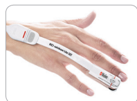
Adt finger application