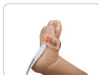
Neo neonatal foot application