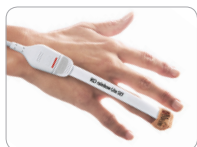
Neo adult finger application